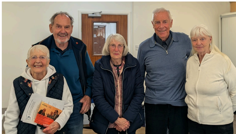
A few of the Bromsgrove u3a members at their first AbilityNet training session.

Helen's counterparts across the UK have worked with other regional u3as but they are all always looking to reach new people within their target audiences. An idea of the areas that have a digital trainer (like Helen) see Digital Skills Training for older people and disabled adults | AbilityNet ; and their latest impact report shows what we achieved in 2025, with the help of over 500 nationwide volunteers too download AbilityNet's latest Impact Report .