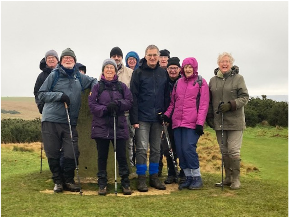
Winter Walkers on Cleeve Hill